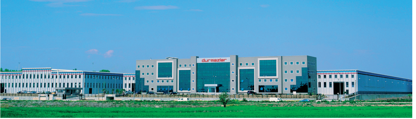
Head Quarter & Ataevler